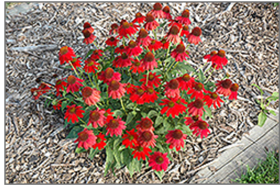
Sombrero Salsa Red Coneflower in bloom

Sombrero Salsa Red Coneflower will grow to be about 16 inches tall at maturity extending to 24 inches tall with the flowers, with a spread of 24 inches. Its foliage tends to remain dense right to the ground, not requiring facer plants in front. It grows at a medium rate, and under ideal conditions can be expected to live for approximately 10 years. As an herbaceous perennial, this plant will usually die back to the crown each winter, and will regrow from the base each spring. Be careful not to disturb the crown in late winter when it may not be readily seen!