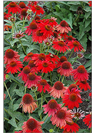
Sombrero Salsa Red Coneflower flowers

This is a relatively low maintenance plant, and is best cleaned up in early spring before it resumes active growth for the season. It is a good choice for attracting butterflies to your yard, but is not particularly attractive to deer who tend to leave it alone in favor of tastier treats. It has no significant negative characteristics.