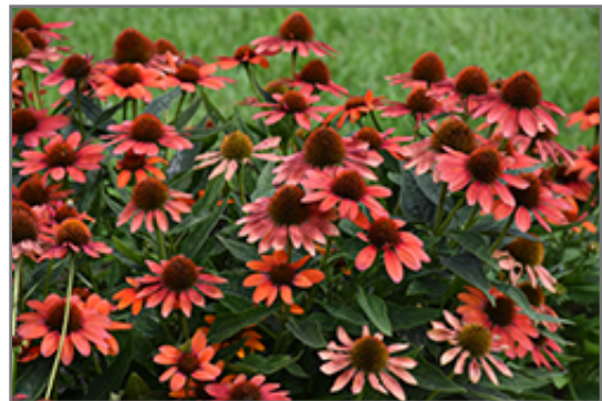
Sombrero Flamenco Orange Coneflower flowers

Ann Arbor 734-332-7900 155 N. Maple at Jackson