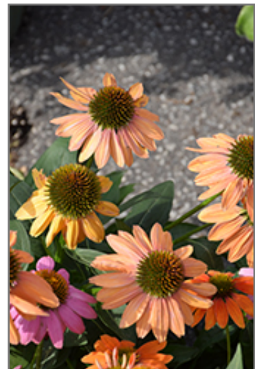
Cheyenne Spirit Coneflower flowers

Ann Arbor 734-332-7900 155 N. Maple at Jackson