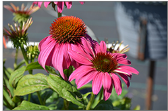
Cheyenne Spirit Coneflower flowers

Cheyenne Spirit Coneflower will grow to be about 16 inches tall at maturity extending to 24 inches tall with the flowers, with a spread of 18 inches. Its foliage tends to remain dense right to the ground, not requiring facer plants in front. It grows at a medium rate, and under ideal conditions can be expected to live for approximately 10 years. As an herbaceous perennial, this plant will usually die back to the crown each winter, and will regrow from the base each spring. Be careful not to disturb the crown in late winter when it may not be readily seen!