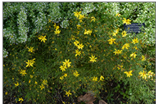
Electric Avenue Tickseed in bloom