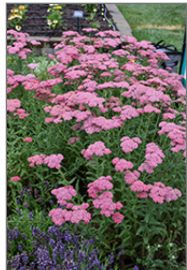
New Vintage Rose Yarrow in bloom