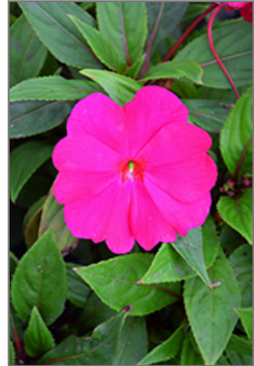
Divine Violet New Guinea Impatiens flowers

Divine Violet New Guinea Impatiens is recommended for the following landscape applications;