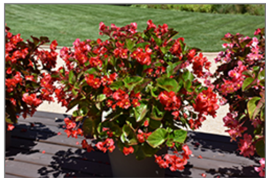
Whopper Red Green Leaf Begonia flowers

Ann Arbor 734-332-7900 155 N. Maple at Jackson