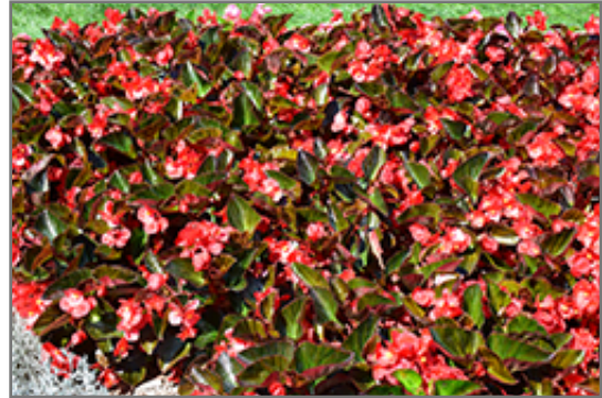
Big Red Bronze Leaf Begonia in bloom