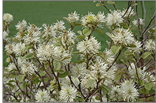
Dwarf Fothergilla flowers

This shrub does best in full sun to partial shade. It requires an evenly moist well-drained soil for optimal growth, but will die in standing water. It is not particular as to soil type, but has a definite preference for acidic soils, and is subject to chlorosis (yellowing) of the foliage in alkaline soils. It is somewhat tolerant of urban pollution. This species is native to parts of North America.