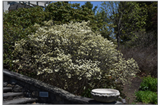
Dwarf Fothergilla in bloom

Dwarf Fothergilla is recommended for the following landscape applications;