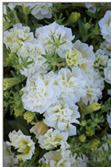
Blanket Double Chardonnay Petunia flowers

Blanket Double Chardonnay Petunia is recommended for the following landscape applications;