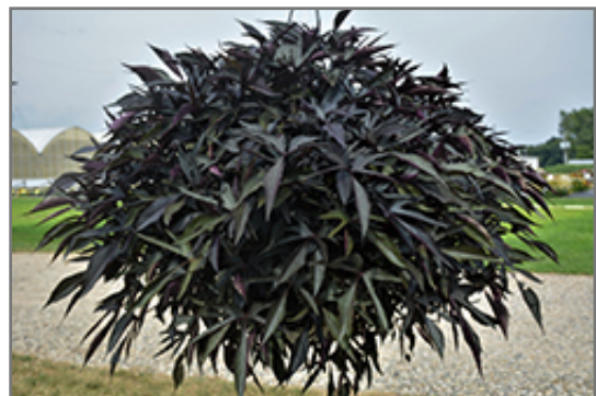
Illusion Midnight Lace Sweet Potato Vine