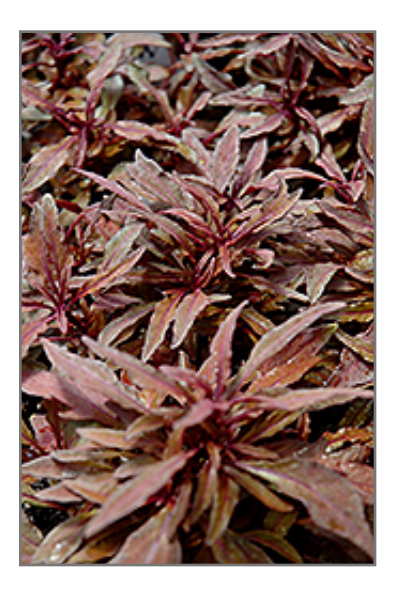
ColorBlaze Velvet Mocha Coleus foliage