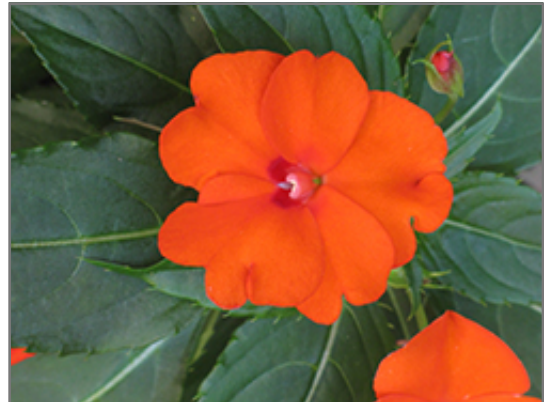
Infinity Orange New Guinea Impatiens flowers

Infinity Orange New Guinea Impatiens is recommended for the following landscape applications;