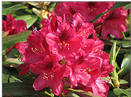
Nova Zembla Rhododendron flowers