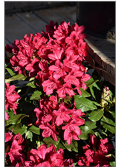
Nova Zembla Rhododendron flowers

This shrub does best in full sun to partial shade. You may want to keep it away from hot, dry locations that receive direct afternoon sun or which get reflected sunlight, such as against the south side of a white wall. It requires an evenly moist well-drained soil for optimal growth, but will die in standing water. It is very fussy about its soil conditions and must have rich, acidic soils to ensure success, and is subject to chlorosis (yellowing) of the foliage in alkaline soils. It is somewhat tolerant of urban pollution, and will benefit from being planted in a relatively sheltered location. Consider applying a thick mulch around the root zone in winter to protect it in exposed locations or colder microclimates. This particular variety is an interspecific hybrid.