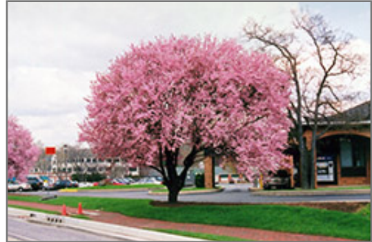
Thundercloud Plum in bloom