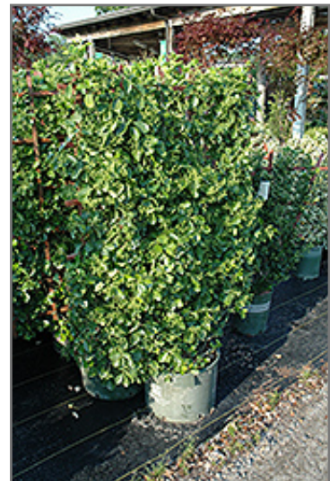
Manhattan Spreading Euonymus