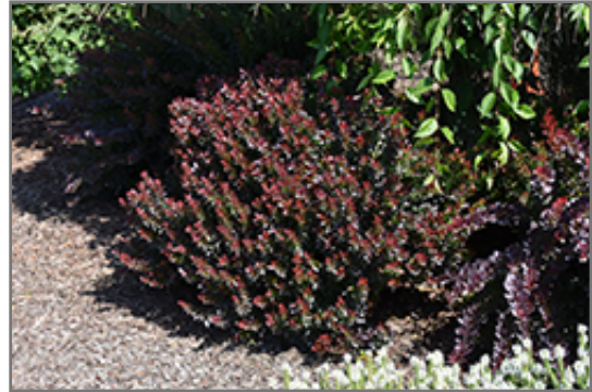
Midnight Ruby Barberry

This shrub does best in full sun to partial shade. It is very adaptable to both dry and moist growing conditions, but will not tolerate any standing water. It is considered to be drought-tolerant, and thus makes an ideal choice for a low-water garden or xeriscape application. It is not particular as to soil type or pH, and is able to handle environmental salt. It is highly tolerant of urban pollution and will even thrive in inner city environments. This is a selected variety of a species not originally from North America.