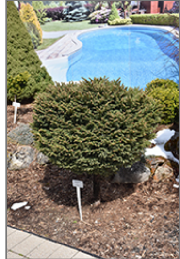
Little Gem Spruce (tree form)