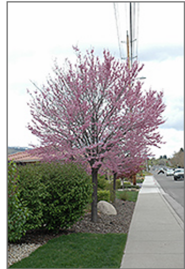
Eastern Redbud (tree form) in bloom

This tree does best in full sun to partial shade. It prefers to grow in average to moist conditions, and shouldn't be allowed to dry out. It is not particular as to soil type or pH. It is highly tolerant of urban pollution and will even thrive in inner city environments, and will benefit from being planted in a relatively sheltered location. Consider applying a thick mulch around the root zone in winter to protect it in exposed locations or colder microclimates. This is a selection of a native North American species.