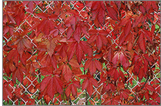
Englemann Ivy in fall