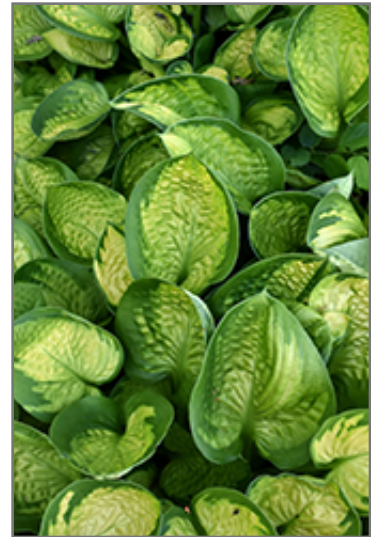
Rainforest Sunrise Hosta foliage

Rainforest Sunrise Hosta is recommended for the following landscape applications;