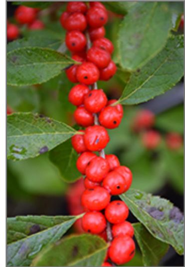
Red Sprite Winterberry fruit