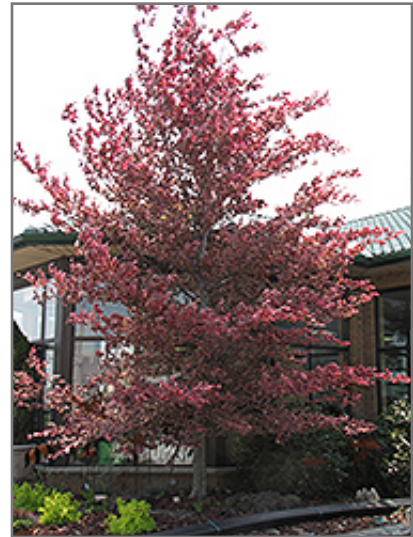
Tricolor Beech