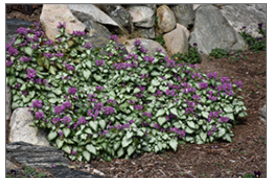
Purple Dragon Spotted Dead Nettle in bloom