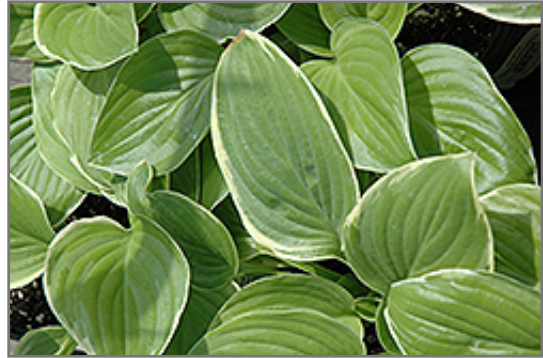
Frozen Margarita Hosta foliage