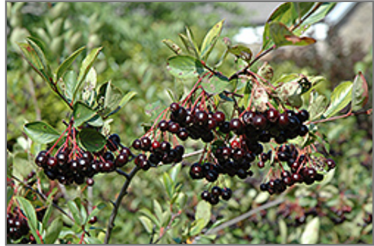
Autumn Magic Black Chokeberry fruit

This shrub should only be grown in full sunlight. It is an amazingly adaptable plant, tolerating both dry conditions and even some standing water. It is not particular as to soil type or pH, and is able to handle environmental salt. It is somewhat tolerant of urban pollution. This is a selection of a native North American species.