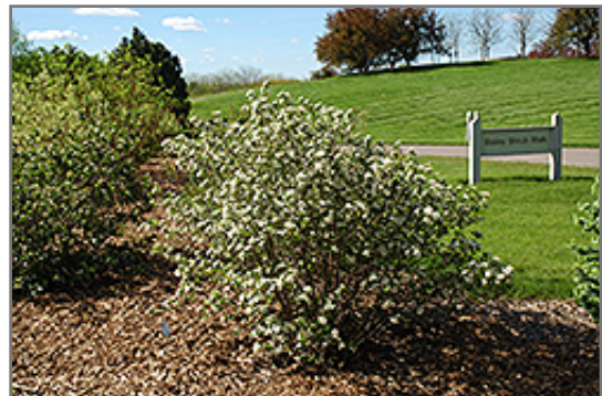
Autumn Magic Black Chokeberry in bloom