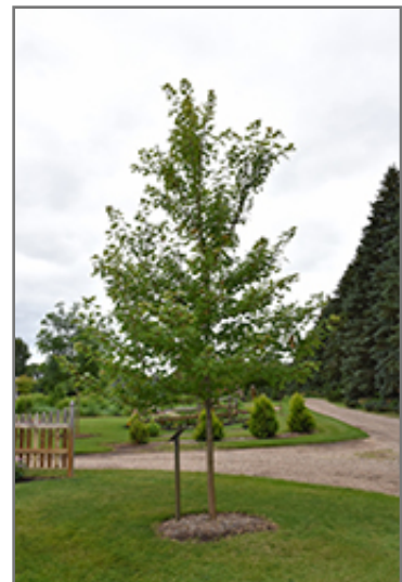
Matador Maple