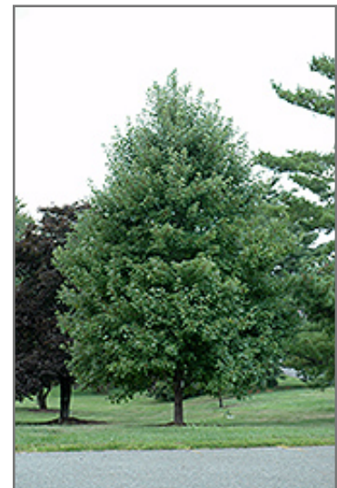
October Glory Red Maple

Ann Arbor 734-332-7900 155 N. Maple at Jackson