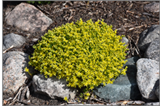
Golden Moss Stonecrop in bloom

Golden Moss Stonecrop is recommended for the following landscape applications;