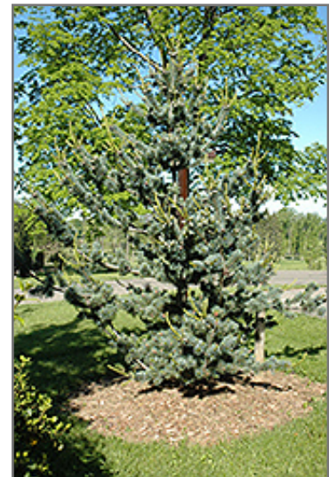
Short-Needled Japanese Blue Pine

Ann Arbor 734-332-7900 155 N. Maple at Jackson