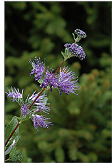
Blue Mist Caryopteris flowers

Blue Mist Caryopteris is recommended for the following landscape applications;