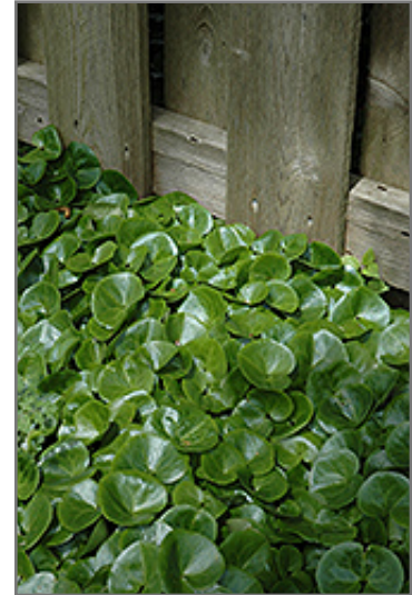
European Wild Ginger