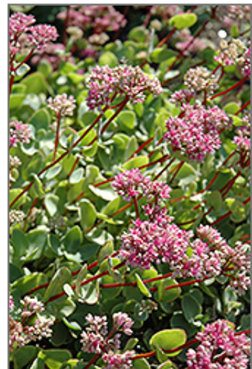
October Daphne flowers

Ann Arbor 734-332-7900 155 N. Maple at Jackson