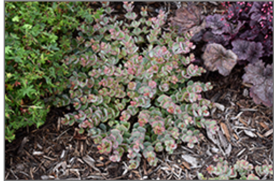
October Daphne

October Daphne is recommended for the following landscape applications;