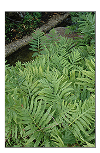
Sensitive Fern foliage