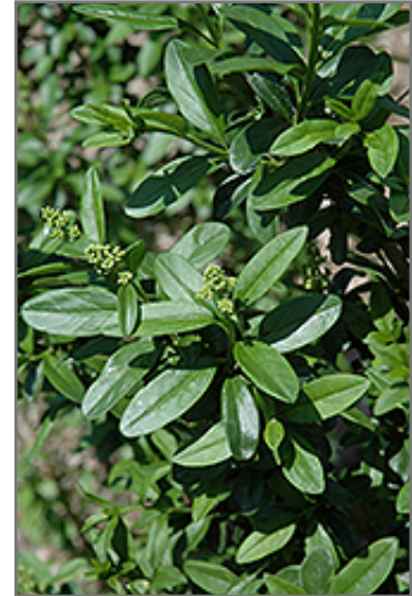
California Privet foliage