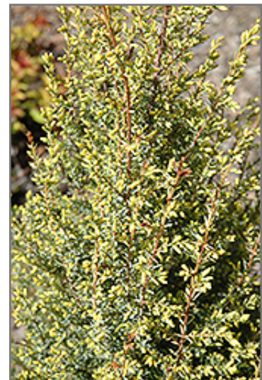
Gold Cone Juniper foliage