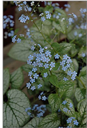
Jack Frost Bugloss flowers