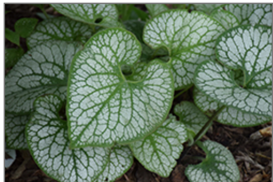
Jack Frost Bugloss foliage