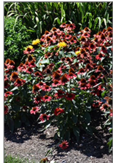
Color Coded Frankly Scarlet Coneflower in bloom

Ann Arbor 734-332-7900 155 N. Maple at Jackson