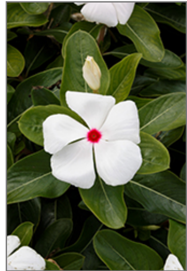
Cora Cascade Polka Dot Vinca flowers

Cora Cascade Polka Dot Vinca is recommended for the following landscape applications;