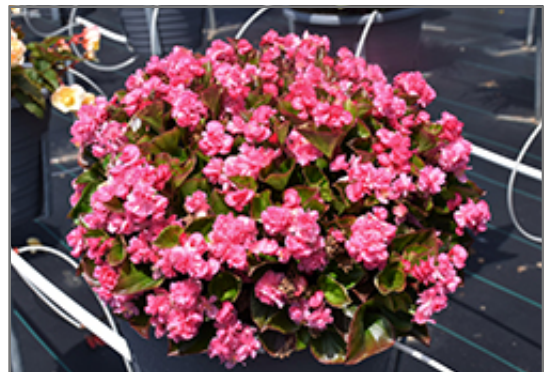
Double Up Pink Begonia in bloom