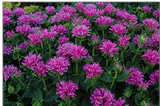
Petite Delight Beebalm flowers