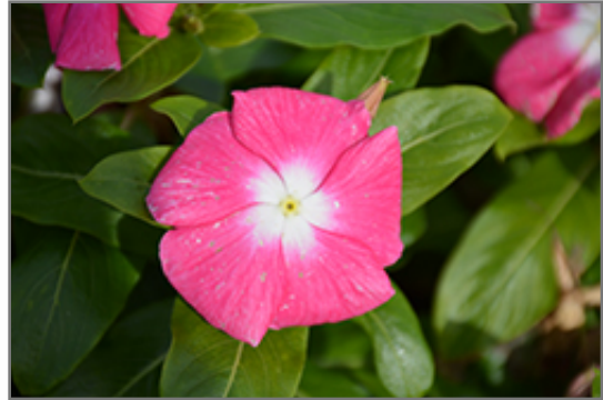
Cora XDR Pink Halo flowers

Cora XDR Pink Halo is recommended for the following landscape applications;