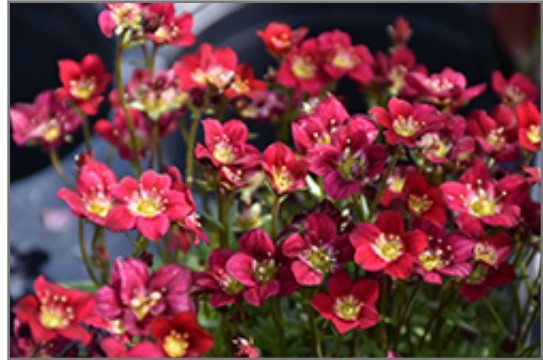
Touran Deep Red Saxifrage flowers

Touran Deep Red Saxifrage is recommended for the following landscape applications;