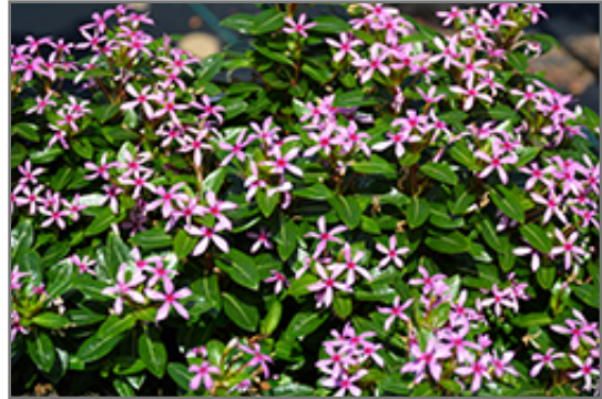
Soiree Kawaii Light Purple Vinca flowers

This plant will require occasional maintenance and upkeep, and should not require much pruning, except when necessary, such as to remove dieback. It is a good choice for attracting butterflies to your yard, but is not particularly attractive to deer who tend to leave it alone in favor of tastier treats. It has no significant negative characteristics.