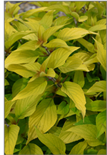
Rockin' Golden Delicious foliage

Rockin' Golden Delicious is recommended for the following landscape applications;