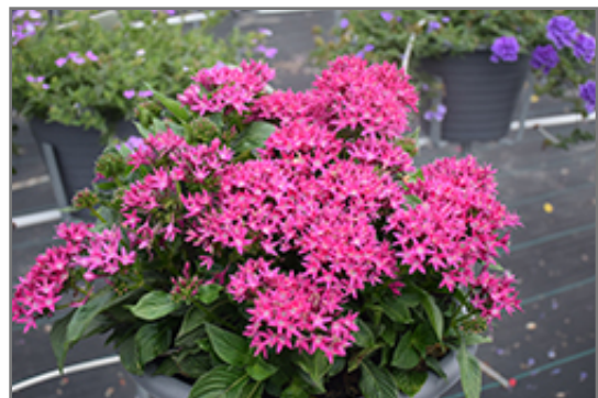
Sunstar Lavender Egyptian Star Flower in bloom