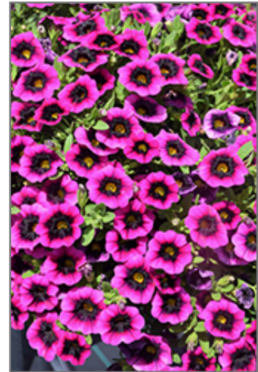
Superbells Blackcurrent Punch Calibrachoa flowers

This plant will require occasional maintenance and upkeep. Trim off the flower heads after they fade and die to encourage more blooms late into the season. It is a good choice for attracting bees and hummingbirds to your yard, but is not particularly attractive to deer who tend to leave it alone in favor of tastier treats. It has no significant negative characteristics.