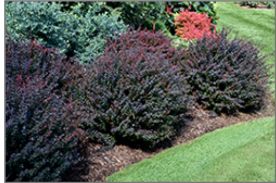
Sunjoy Mini Maroon Japanese Barberry

Sunjoy Mini Maroon Japanese Barberry is recommended for the following landscape applications;