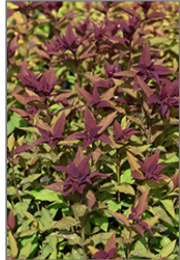
Double Play Doozie Spirea foliage

This shrub should only be grown in full sunlight. It prefers to grow in average to moist conditions, and shouldn't be allowed to dry out. It is not particular as to soil type or pH. It is highly tolerant of urban pollution and will even thrive in inner city environments. This particular variety is an interspecific hybrid.