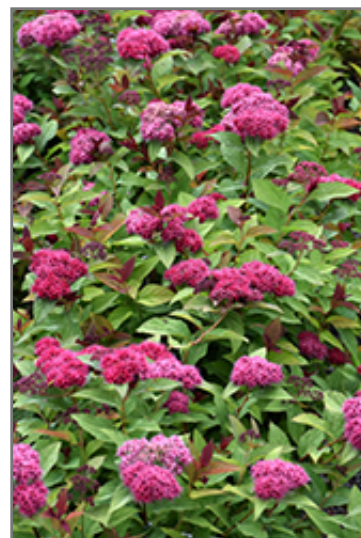
Double Play Doozie Spirea flowers

Ann Arbor 734-332-7900 155 N. Maple at Jackson