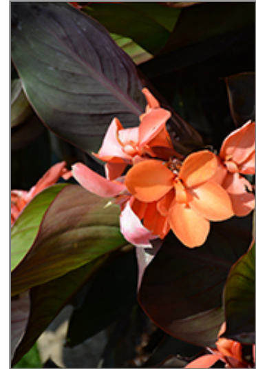
CannaSol Happy Wilma Canna flowers

This plant is native to the tropics and prefers growing in moist environments with evenly warm conditions all year round. In our climate, it is usually grown as an outdoor annual in the garden or in a container. If you want it to survive the winter, it can be brought in to the house and provided with special care, and then returned to the garden the following season. In its preferred tropical habitat, it can grow to be around 18 inches tall at maturity, with a spread of 14 inches. However, when grown as an annual or when overwintered indoors, it can be expected to perform differently, and its exact height and spread will depend on many factors; you may wish to consult with our experts as to how it might perform in your specific application and growing conditions.